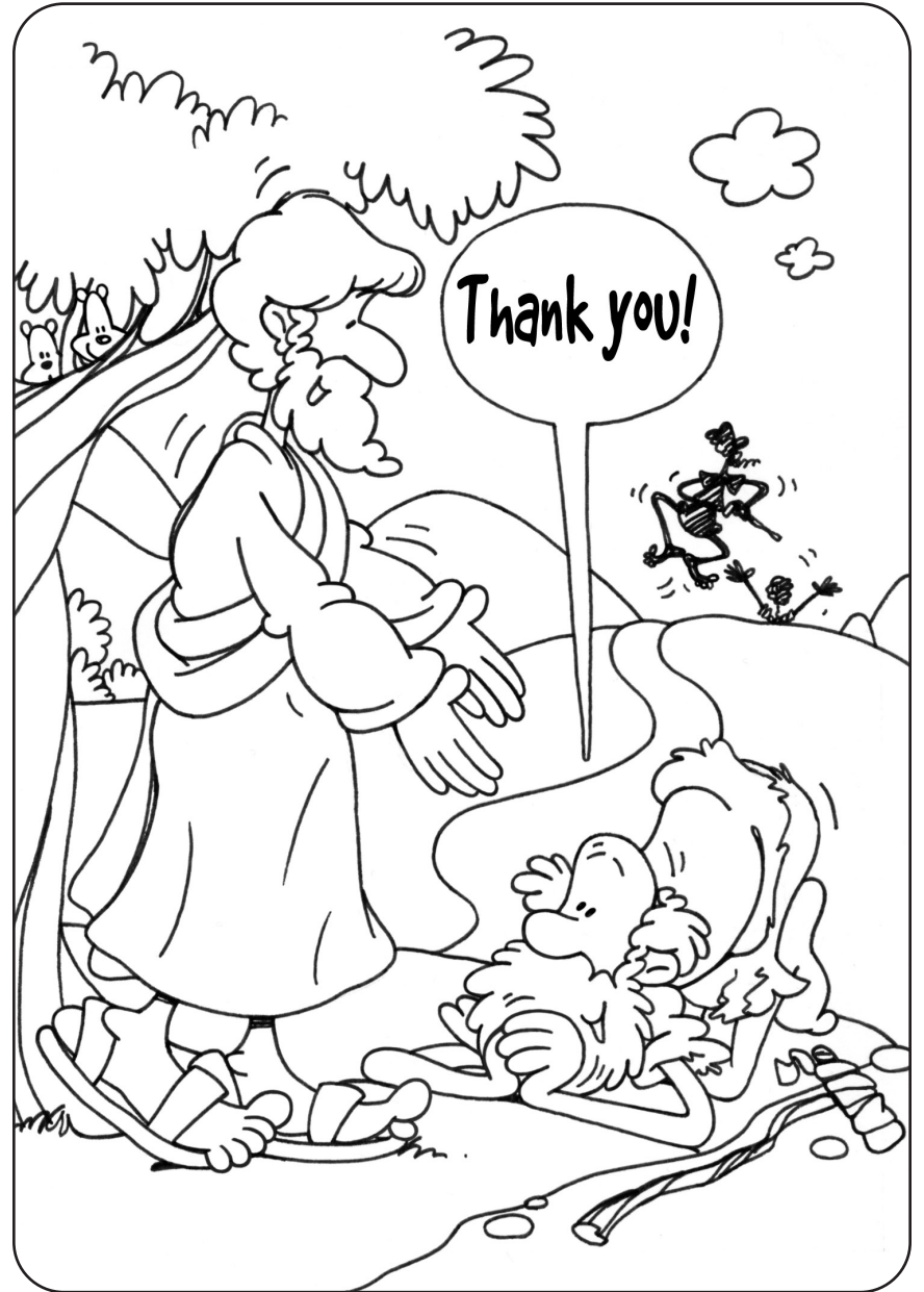
He said to him, "Rise and go your way; your faith has made you well." Luke 17:19