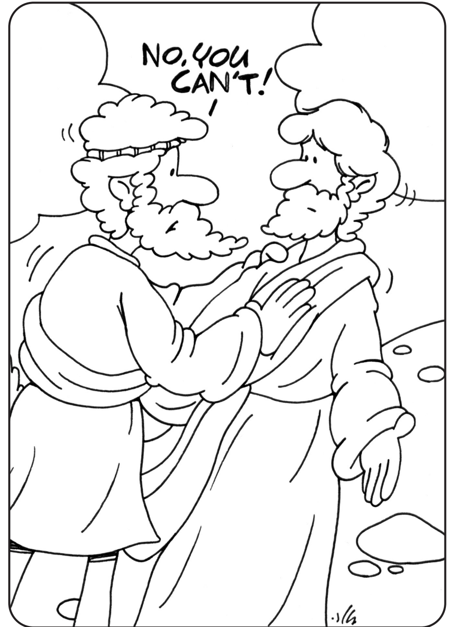
Peter took Him aside and began to rebuke Him. Matthew 16:22

Permission to copy granted for one-time use on September 3, 2023, only.