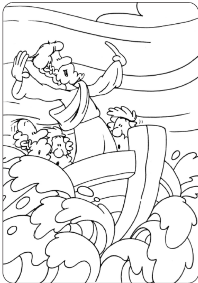
He awoke and rebuked the wind and said to the sea, "Peace! Be still!" Mark 4:39