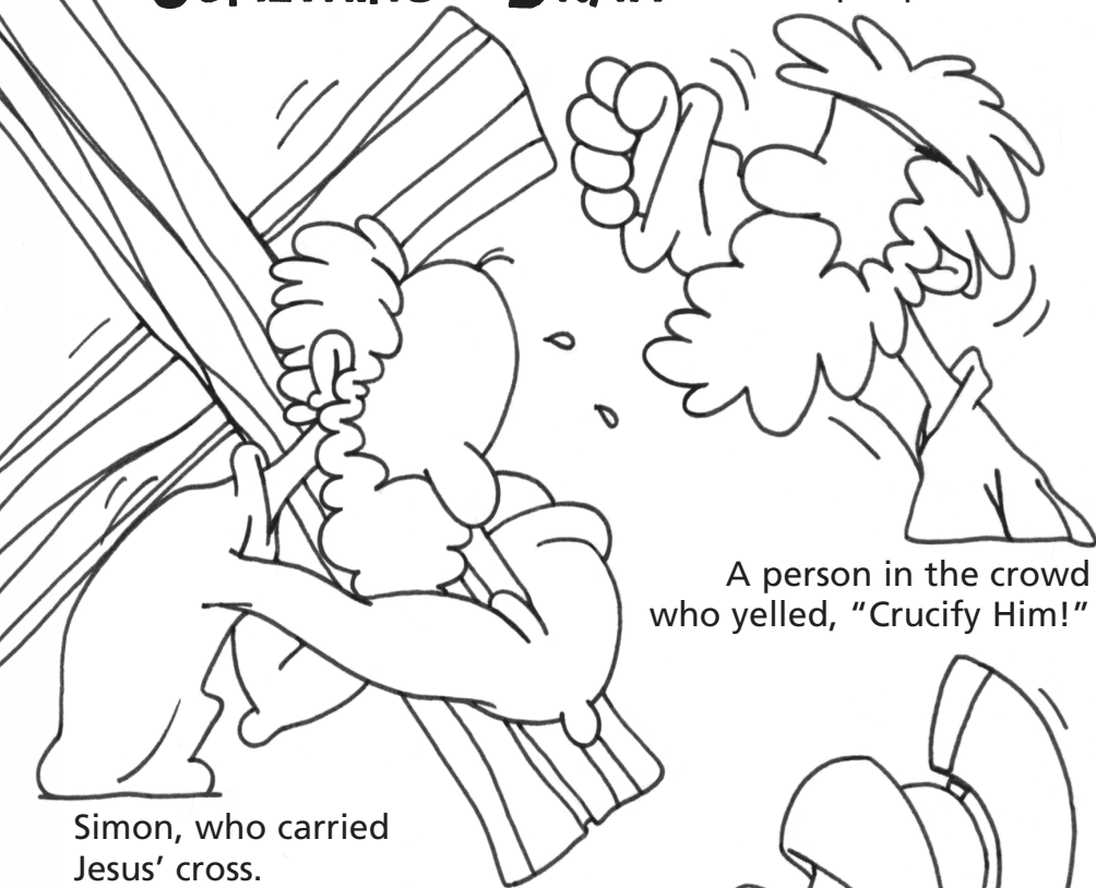
Simon, who carried Jesus' cross.